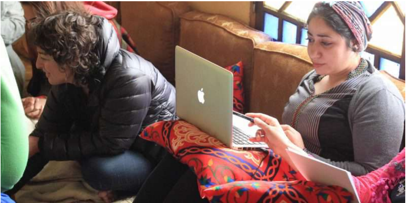
Game art workshop and lecture, Fayoum Art Center, Egypt, 2014

Le catalogue d'exposition viendra enrichir l'essai de matériaux inédits et spécifiques à l'exposition itinérante.