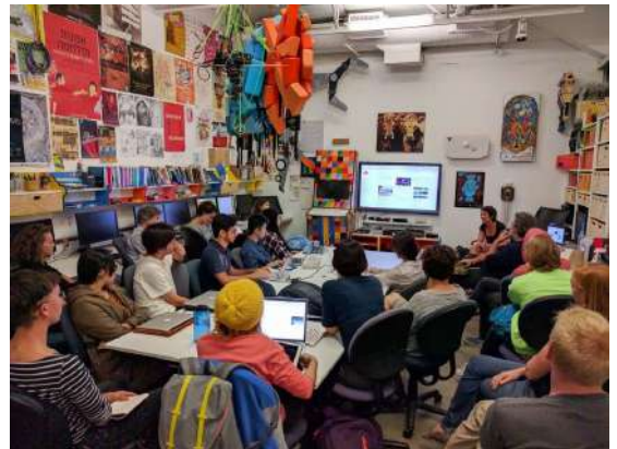
Machinima workshop, UCLA Game Lab, 2016