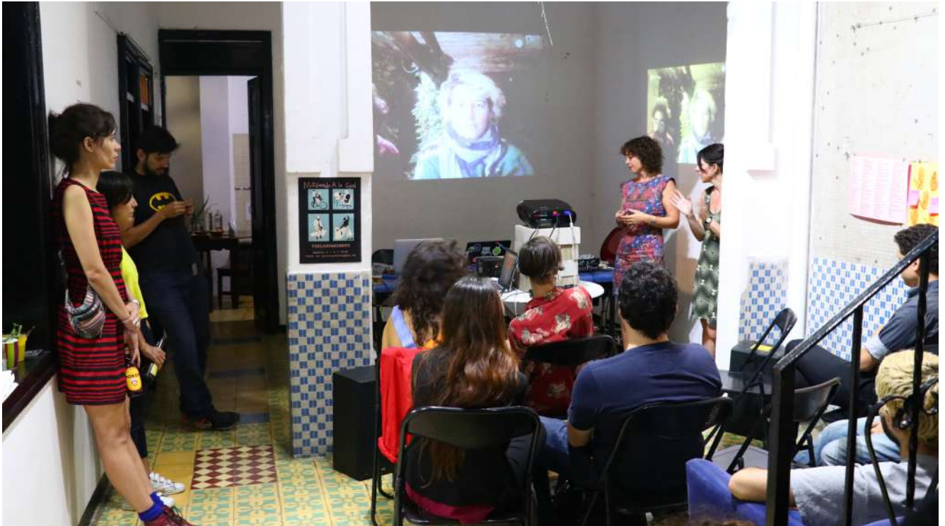
Art Games Demos, Platohedro, Medellin, 2018

Cette expérience fondatrice s'est attachée à mettre en valeur les questions de la diversité, du genre et de la décolonisation , tout en analysant les méthodes de travail et d'échanges des différentes communautés afin d'en valoriser leur caractère innovant et inspirant. Elle donne ainsi l'impulsion à imaginer un projet encore plus inclusif, transversal et ambitieux :