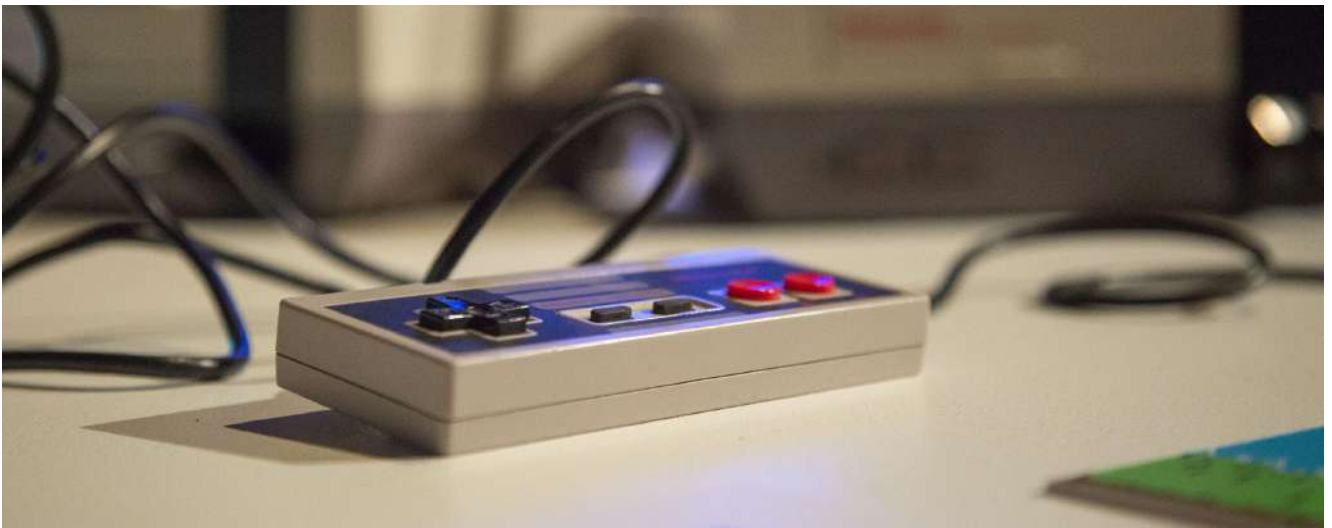
Evolution of Gaming, Center for Digital Media, Vancouver, 2013

ART+GAMES WORLDTOUR vise non seulement à découvrir de nouveaux talents et des modes différents de traiter la question de la diversité mais il se propose aussi de créer du lien et à initier des collaborations avec les milieux du game art, du jeu indépendant, de l'art DIY en Asie, en Inde, au Moyen Orient, en Amérique latine et en Afrique . Il s'agit d'aller à la rencontre des acteurs de ce champ d'exploration artistique, de prendre le temps de partager des méthodes innovantes du travailler ensemble et de concevoir le monde , d'échanger afin de développer un faire ensemble totalement nouveau et qui mette le plus possible en valeur la création féminine et les pratiques queer et décoloniales .