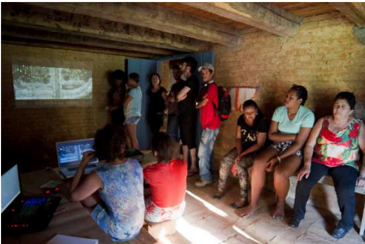
Machinima workshop and exhibit in a farm, San José de Barrero, Brasil, 2015