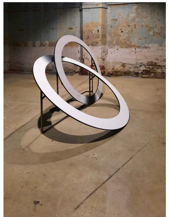
View of the mounted work